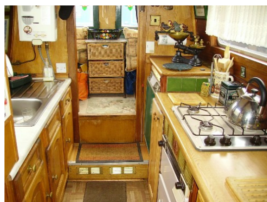
A 1990 40ft traditional stern Burden Brothers narrowboat

Interior: Floor covered marine ply, cabin sides faced ply with oak trim, hull sides painted ply lower and faced ply upper, coach style deckhead with brass fittings. Galley fitted with Vanette SL4 cooker, Electrolux RM 4201 fridge and a hob burner. Bathroom has a shower, basin and Porta Potti Thetford 365 toilet with a 21ltr tank capacity and spare cassette. The aft cabin has two single seating areas which can convert into a double bed.